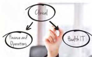
THOUGHT LEADERSHIP COUNCILS

Advancing the science of patient and family engagement