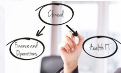
THOUGHT LEADERSHIP COUNCILS

University of Virginia School of Nursing